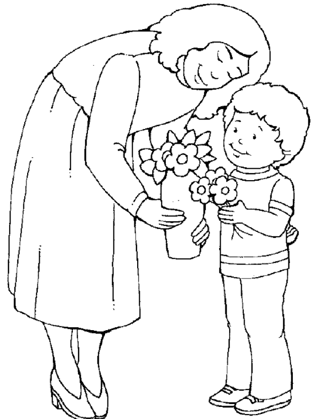
She likes beautiful things.