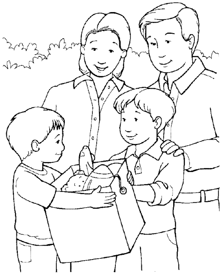
She teaches me to share with others.