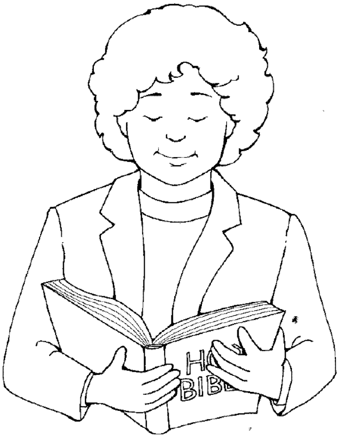
She reads God's Word.